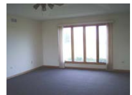
LR West Window