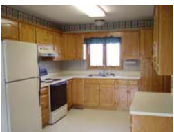
Kitchen Work Area