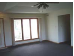
LR East Window