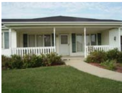
Lovely Front Porch